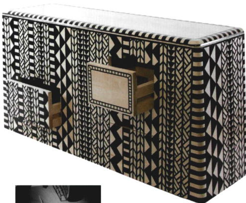
Dokter and Misses Kassena Server, black, 2014 1 800 × 500 × 900 mm Handpainted pink beech on castors