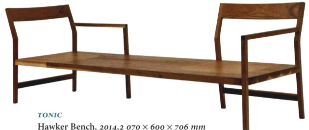
TONIC Hawker Bench, 2014, 2 070 × 600 × 706 mm American walnut and maple