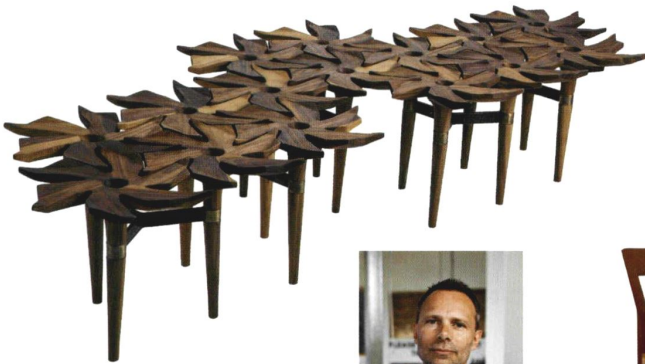
John Vogel Bloom, 2013, 2 100 × 900 × 400 mm American walnut and bronze

www.southernguild.co.za • www.basel2014.designmiami.com